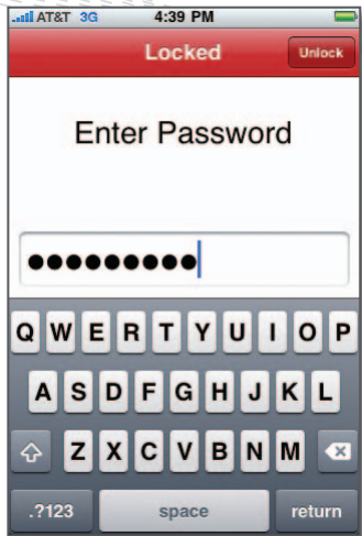
An application password provides an additional layer of security.